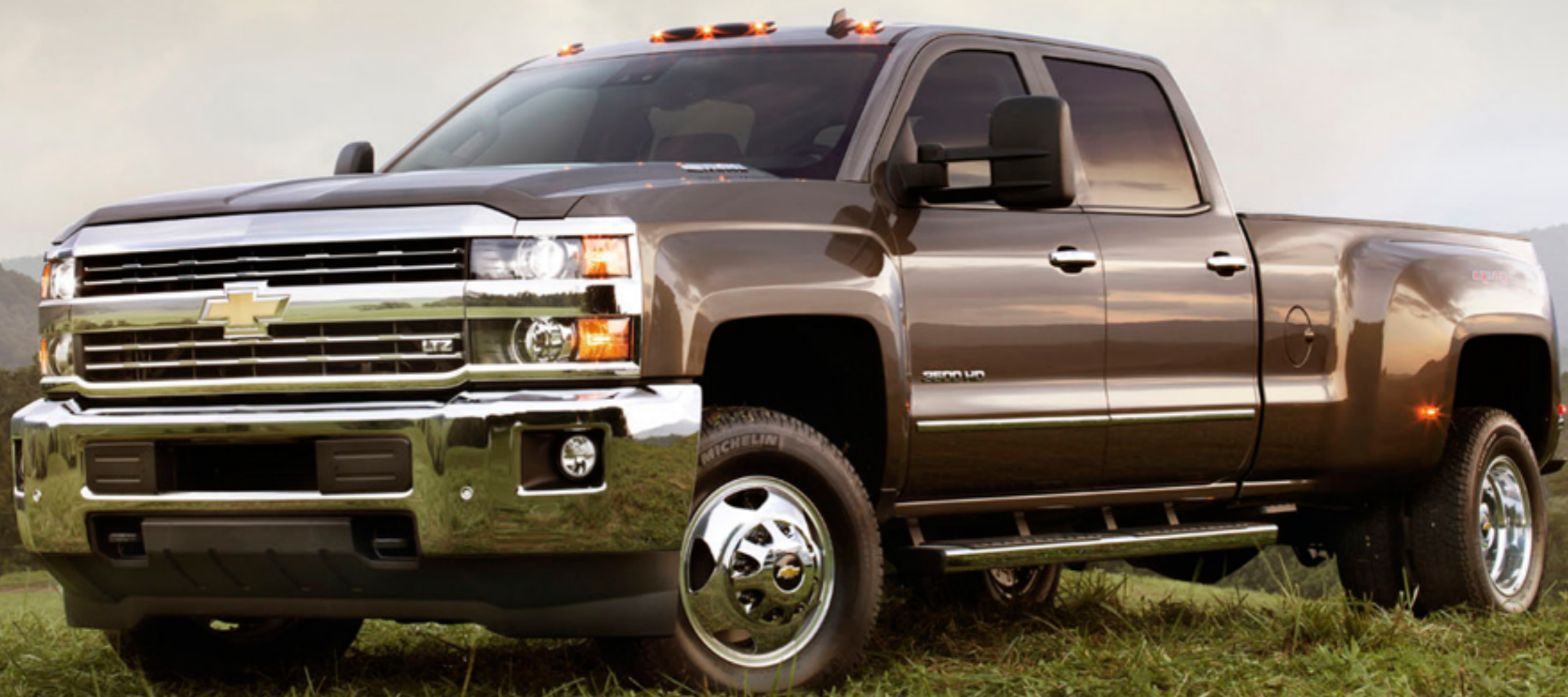
2015 Chevrolet Silverado 3500HD, MSRP $33,730